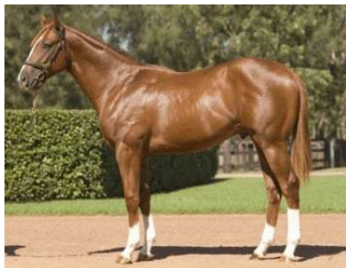
Lot 274 www.inglis.com.au