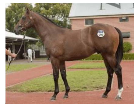
Lot 296 www.inglis.com.au

A day after Kitchwin Hills purchased a A$1.875-million Redoute's Choice (Aus) colt, the boutique Upper Hunter Valley farm celebrated its first six-figure sale