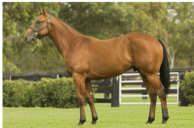
Lot 227