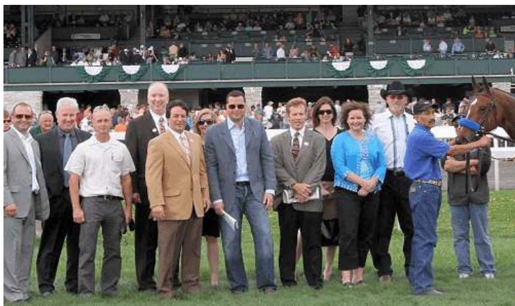
Connections of Franny Freud

GII Beaumont S. 3yo filly Franny Freud (Freud) romps.