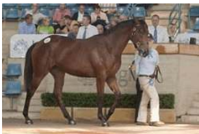
Lot 448 in the ring www.inglis.com.au