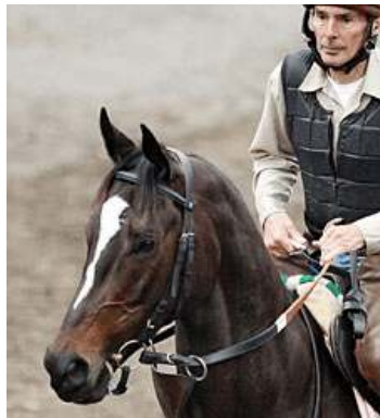
Zenyatta on track for a second Apple Blossom

By a show of hands, who would take a win mutuel of over $3 on Zenyatta (Street Cry {Ire}) as she goes for a second win in the GI Apple Blossom Invitational S. today at Oaklawn Park? The reality is that the return on any win investment will likely be something much