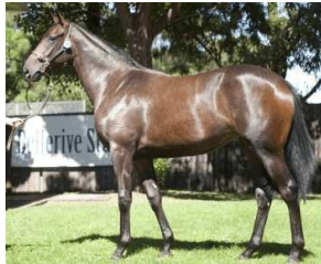
Hip 404 - Redoute's Choice filly