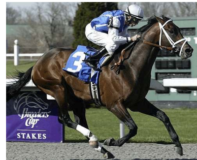
Exhi