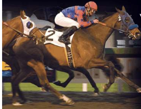
CRISP shown winning the Grade 1 Santa Anita Oaks

In 2010, El Corredor is the Sire of Grade 1 Winner CRISP who is being pointed towards the Grade 1 Kentucky Oaks and Stakes Winner RONJA who is being pointed towards the German 1000 Guineas.