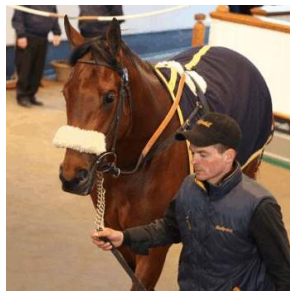
Lot 122 - Elusive Quality colt