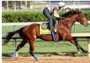
Lookin at Lucky

Trainer Bob Baffert's Kentucky Derby contenders arrived at Churchill Downs Tuesday and were on track yesterday for five-furlong drills. Juvenile champion Lookin at Lucky (Smart Strike) went the distance in an easy 1:01.20, while stablemate Conveyance (Indian