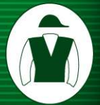
chart / video