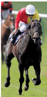
Elusive Pimpernel