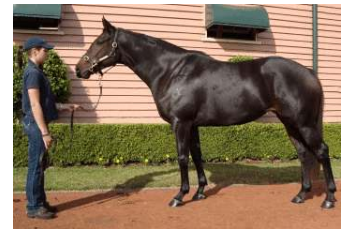
Bel Mer