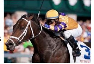
Stately Victor EquiSport

The breeze show will begin at 8 a.m., and selling starts at 6 p.m. In years past, the sale had been held in March, but it now kicks off a week of selling at OBS April. The 2009 auction, where 44 juveniles sold for an average of $44,771, was topped by a $250,000 son of Ghostzapper--