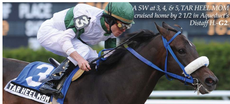
A SW at 3, 4, & 5, TAR HEEL MOM cruised home by 2 1/2 in Aqueduct's Distaff H.-G2.

Flatter A.P. INDY - PRAISE, by MR. PROSPECTOR $5,000 Stands & Nurses