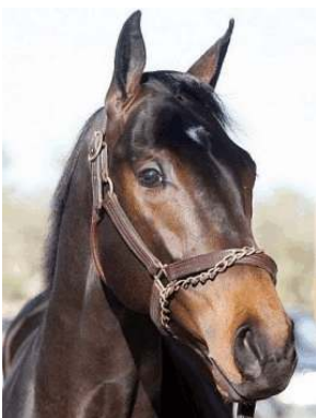
Al Zir after selling for $1.6 million at FTFFEB in 2009