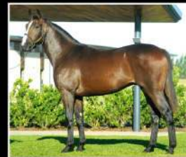
LOT 10 TIZNOW - PENNY HOLE