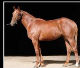
LOT 19 DISTORTED HUMOR - INDYVERSE [Arg.]