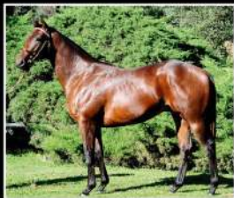
LOT 3 SOUTHERN HALO - FAIRY STORY [Arg.]

SOUTHERN HALO DISTORTED HUMOR RUSSIAN BLUE TIZNOW MALIBU MOON MUTAKDDIM BERNSTEIN