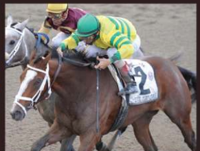
DEVIL MAY CARE