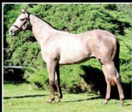
LOT 6 MUTAKDDIM - BROMITA [Arg.]