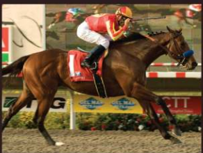
LOOKIN AT LUCKY