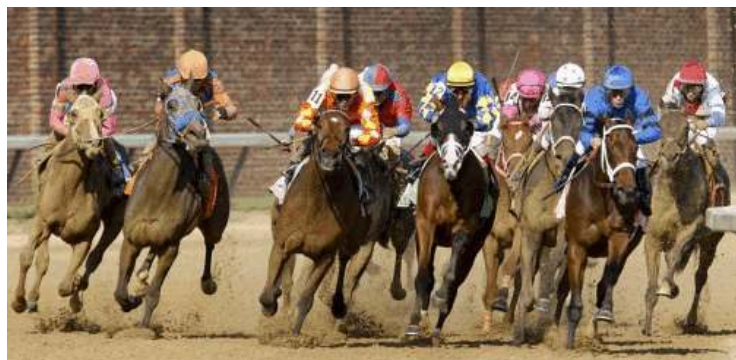
Blind Luck (far left) rounds the turn in the GI Kentucky Oaks

Blind Luck won as the 6-5 favorite in the Kentucky Oaks...through advance betting Friday, the early favorite for the GI Kentucky Derby was Super Saver (Maria's Mon) at 7-1.