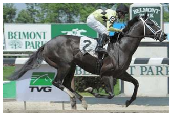
Christmas for Liam