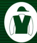
chart / video

Debut winner at Keeneland, Dogwood Stable's LOU BRISSIE is now pitch perfect with this 1 1/2-length win in his 1st Graded stakes.