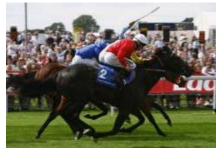
Elusive Pimpernel