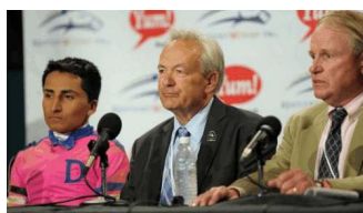
Post-Oaks press conference

Blind Luck won as the 6-5 favorite in the Kentucky Oaks...through advance betting Friday, the early favorite for the GI Kentucky Derby was Super Saver (Maria's Mon) at 7-1.