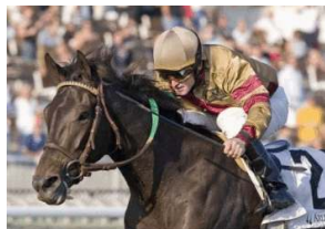
Hot Cha Cha