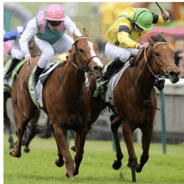
Special Duty (left) & Jacqueline Quest