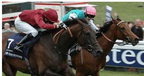
Sariska (7) edges Midday in 2009 Epsom Oaks

“From what I’ve heard, it is very nice ground and we are very keen to run her, she’s in tremendous form,” Bell told PA Sport . “She’s actually run very well twice