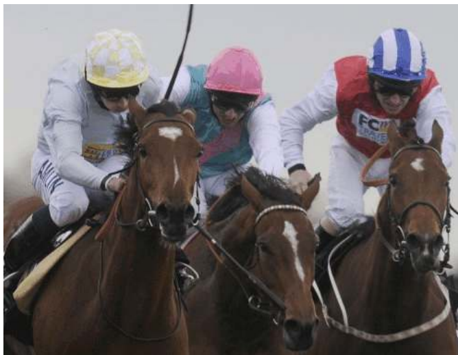
Aviate (center) fights her way to victory

Unbeaten after a Kempton maiden in November and an Ascot conditions event on her sophomore bow Apr. 28, Aviate had stamina to prove stepping up from a mile, but had adequate reserves to provide Henry Cecil with a ninth renewal of this noted trial. Reserved in fifth early by Eddie Ahern, the bay looked to have nowhere to go approaching the final furlong as Gold Bubbles took a short-lived lead off Eleanora Duse. Finding a large enough gap between the latter and the tiring early pacesetter Bikini Babe (Ire) (Montjeu {Ire}) soon after, the homebred quickened impressively on the rail to snatch the contest in the shade of the post. "When they quickened, I was in a little bit of trouble, as I wasn't getting the gaps and I had to sit and suffer for a long time," Ahern explained. "I switched her back onto the inside and she picked up really well. The trip was not a problem, and I think she'll get further."