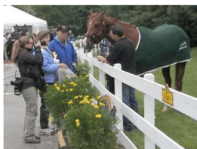
Dublin meets the press

When it comes to winning the Preakness, few trainers can boast the type of success that trainer D. Wayne Lukas has enjoyed over the last three decades. After