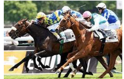
Special Duty (outside)

once more after original first past the post Liliside (Fr) (American Post {GB}) wreaked havoc in the closing stages of the G1 Poule d'Essai des Pouliches at Longchamp yesterday. Avoiding the trouble