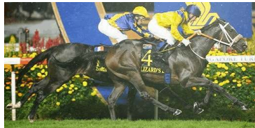
Singapore Turf Club

with a vengeful half-length score here. Brazilian-bred Gloria De Campeo, who took this race last year in front-running fashion, was relegated to pressing duties in this edition behind local mare Jolie's Shinju (Jolie's