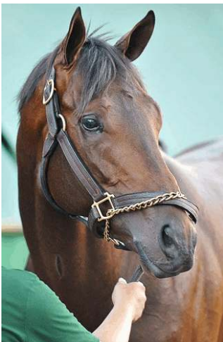
Super Saver