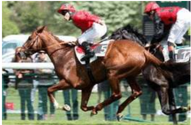
Lope de Vega

Gestut Ammerland's "TDN Rising Star" Lope de Vega (Ire) (Shamardal) swooped late to emulate his sire and win yesterday's G1 Poule d'Essai des Poulains at Longchamp. Third last time in the main trial, the