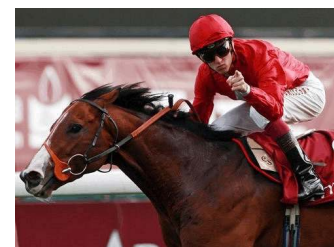
Paco Boy