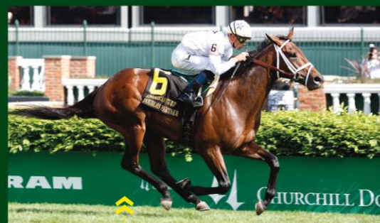
His 3YO C. DOUBLES PARTNER takes the G2 American Turf S.

ROCK HARD TEN THE LEADING SECOND-CROP SIRE OF GRADED WINNERS