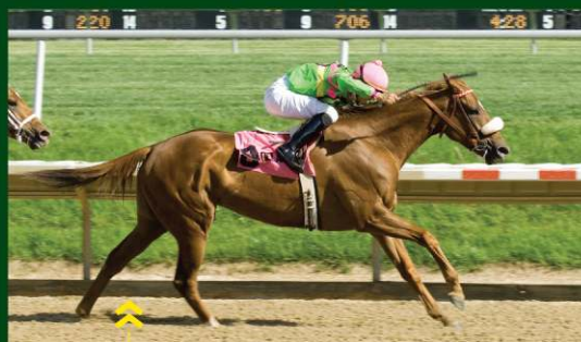
His 4YO F. MINDY SUE Wins the Winter Melody S.

ROCK HARD TEN THE LEADING SECOND-CROP SIRE OF GRADED WINNERS