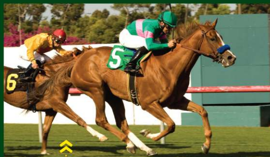
His 3YO F. COZI ROSIE takes the G3 Senorita S.

PLEASANTLY PERFECT WITH JUST TWO CROPS TO RACE, 17% STAKES HORSES/STARTERS