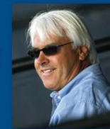
Bob Baffert, Trainer

“...a very tactical horse , and I love tactical speed. He posted impressive figures as a 2YO (106, 109) and then kept it up as a 3YO (113 in April) – that’s a true racehorse , to me.”