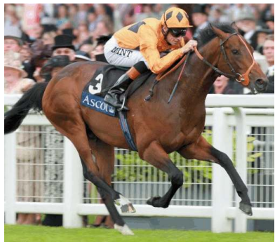
Canford Cliffs

Steinbeck was behind stable companions Beethoven (Ire) (Oratorio {Ire}), Fencing Master (GB) (Oratorio {Ire}) and Xtension (Ire) (Xaar {GB}) in the Dewhurst, and the latter pair have the advantage of race fitness here,