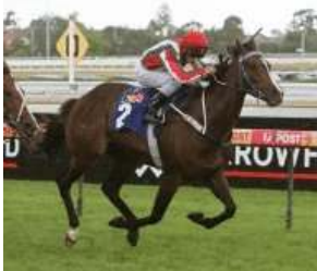
Lucky Diva (Aus) www.inglis.com.au

bury (Aus) (Sir Tristram {Ire}). The unraced mare was one of three mares to top the A$100,000 mark during the opening session of the Broodmare sale. Also surpassing the mark was Hip 951 , the nine-year-old Red Ransom mare Ransom Claim (Aus) . Out of multiple stakes winner and Group 1 placed Loving Cup (Aus) (Bluebrid), the nine-year-old sold late in the day to Patinack Farm for A$100,000.