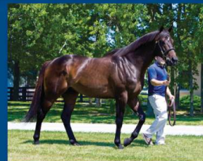
Seeking the Gold – Minister's Melody, by Deputy Minister