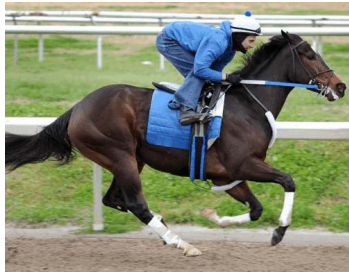
Rachel Alexandra