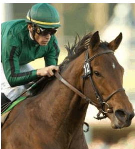
Gio Ponti