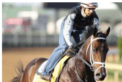
Stately Victor

Stately Victor (Ghostzapper), the GI Toyota Blue Grass S. upsetter and eighth to Super Saver (Maria's Mon) in the GI Kentucky Derby May 1, drilled five furlongs in :59.40 at the Trackside Training Center Tues-