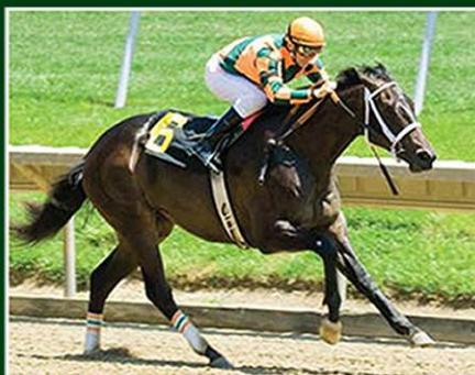
RAISED WITH PRIDE