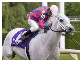
Four Footed Foto

The veteran Silverfoot (With Approval--Northern Silver, by Silver Ghost) has been retired. Owned by Chrysalis Stables, the 10-year-old was unplaced in all three of his appearances this year, most recently running eighth in the GIII Louisville H. May 22, a race he had won three times previously. In addition to that triple, the