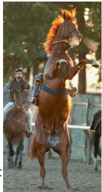
Point Given