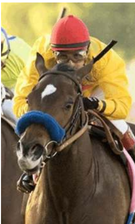
Tuscan Evening

Both Tuscan Evening (Ire) (Oasis Dream {GB}) and Forever Together (Belong to Me) have a bit to prove when they face off this evening in the G1 Gamely S. at Hollywood. A deserving morning-line favorite, Tuscan Evening has put together an impressive four-race skein on the Santa Anita sod, with successive graded scores from 6 1/2 furlongs to 10 panels in her latest trip to the winner's circle in the GII Santa Barbara H. Apr. 17. The speedy bay has also won three of four starts over this course, with her only loss coming when second to Ventura (Chester House) in the G1 Matriarch S. in November. The only thing missing from her resume is a Grade I event and, unless someone runs with her early here, it looks as though she'll be able to check that off. "Our filly runs on the front end or off the