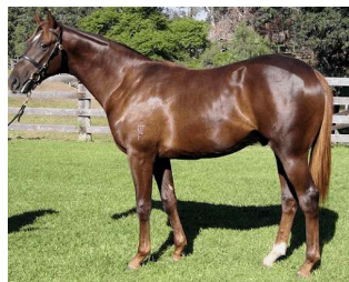
$320,000 Encosta de Lago-- Ellicorsam magicmillions.com.au

'LAGO' TRIO LEAD WAY AT NATIONAL SALE Offspring by Coolmore's star sire Encosta de Lago (Aus) were in high demand during a strong second session of the Magic Millions National Yearling Sale on the Gold Coast yesterday. The top three lots were all by the Fairy King stallion, including a son of the Group 1-winning mare Ellicorsam (Aus) (Fimiston {Aus}) who topped the day on Patinack Farm's offer of A$320,000 (US$261,242) (US$1 = A$1.22441). Con-