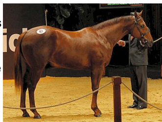
Hip 41, by Distorted Humor

(Southern Halo), was the day's second-highest-priced lot at $134,177. Las Dos Nenas was the winning bidder for the half to Upcoming Story (Tale of the Cat), twice Grade III-placed in the U.S. Haras La Pasion consigned the colt, named Macho Star (Arg).