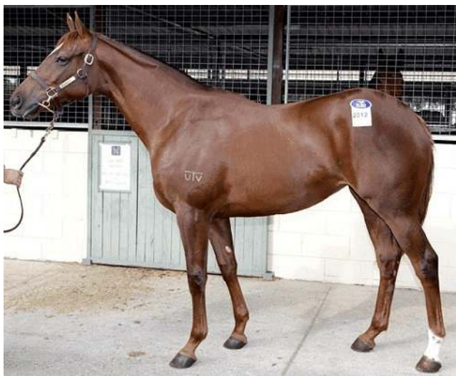
$280,000 Encosta de Lago--Calaway Gal magicmillions.com.au