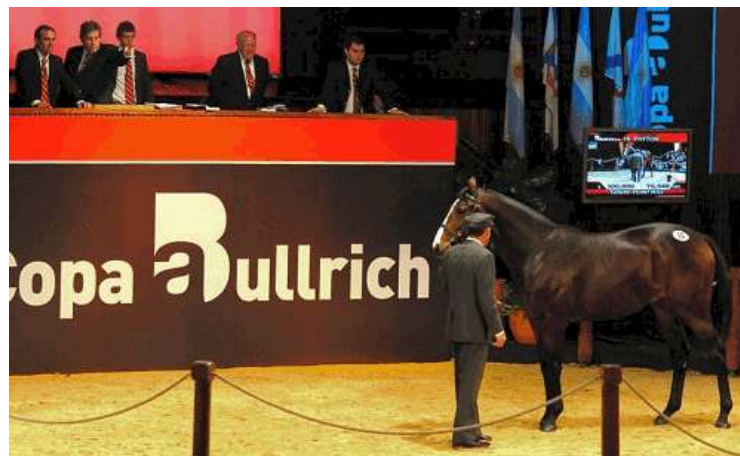
Hip 10, sale-record Tiznow-Penny Hole colt, who made $162,025