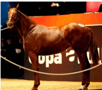
Hip 19, by Distorted Humor