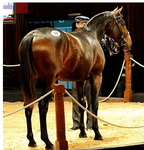
Hip 10, by Tiznow

Sunday's opening session of the Copa Bullrich Yearling Sale at San Isidro in Buenos Aires, Argentina, got