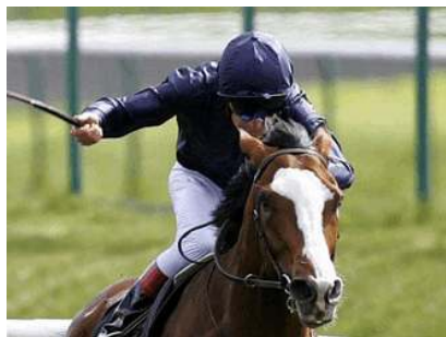
Age of Aquarius

Like Age of Aquarius, Khalid Abdullah's Manifest is still unexposed just out of his sophomore year, and represents a multiple-winning stable in Henry Cecil's Warren Place. Only third behind Akmal in the Listed Noel Murless S. at Newmarket in October, the homebred was having his first start subsequently when runner-up to Age of Aquarius's conqueror Harbinger in the G3 John Porter S. at Newbury Apr. 17. He took a step forward to beat Purple Moon by eight lengths in the May 14 G2 Yorkshire