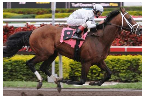
Battle Plan