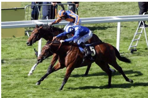
Maqaasid (near side)

Maqaasid created a favorable impression, following an inauspicious break, when pouncing late to claim a Sandown maiden on debut May 20, and employed similar waiting tactics to register a personal best in juvenile track-record time here. The bay homebred was steadied at the start and settled in the wake of the