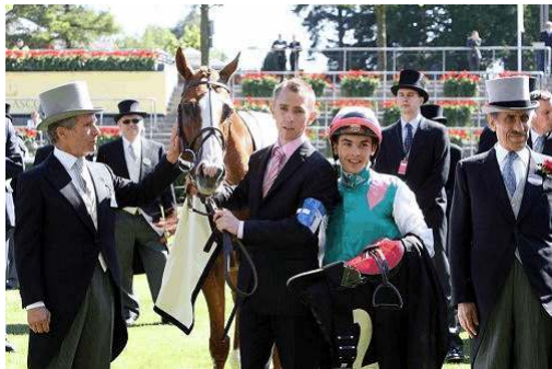
Prince Khalid Abdullah (far right) joins Byword in the winner's enclosure

Byword was one of Andre Fabre's unraced projects at the start of last term and, after winning on debut at Maisons-Laffitte in June, added the Listed Prix Pelleas at Compiègne to his resume the following month. Only fourth in both the G2 Prix Guillaume d'Ornano at Deauville in August and G3 Prix du Prince d'Orange at Longchamp in September, he was put on the backburner and showed the benefit of that patience when returning to best Unnefer (Fr) (Danehill Dancer {Ire})