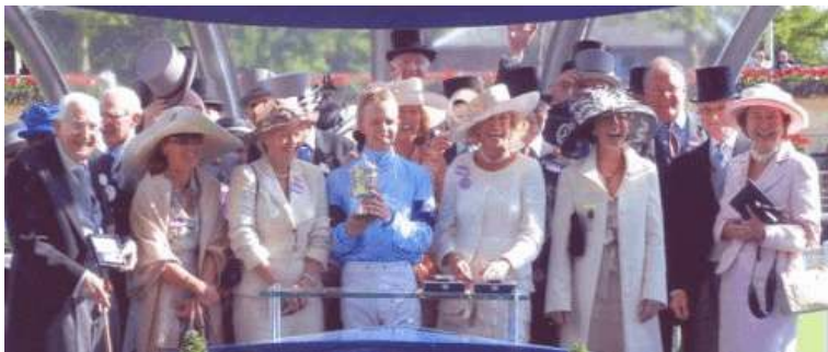
Highclere in the Winner’s Circle