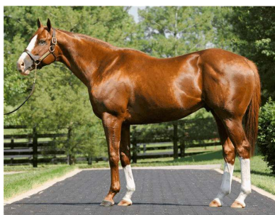
Master Command