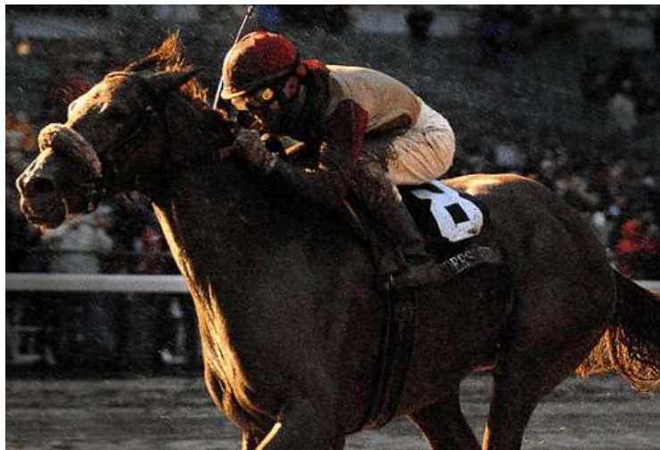
Corinthian winning the GI BC Dirt Mile in '07

Gainesway would be a lot higher on him than they were, say, on Tapit at this stage of the game. Corinthian looks sure to be a horse that will get a fair hearing by the buyers; there's a good vibe about him. Cont. p9