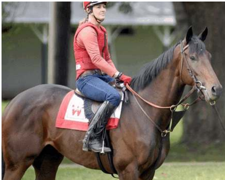
Street Sense & Claire Court at Saratoga