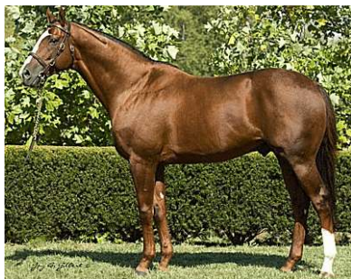
Stevie Wonderboy airdriestud.com