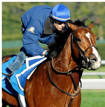
Discreet Cat

Discreet Cat was actually the fastest of the Darley horses, running Beyers of 115 and 116, respectively, when winning two one-mile races at Belmont Park at the end of his three-year-old year in 2006: the