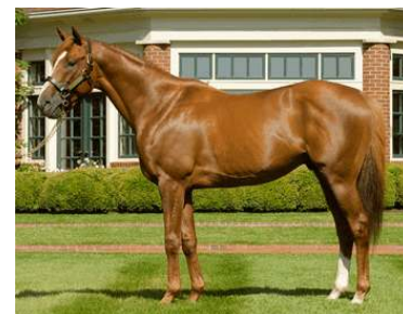
English Channel