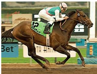
Latent Heat