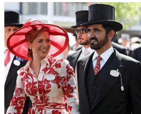
Princess Haya & Sheikh Mohammed

In the second half of 2007, when money was still flowing freely, Sheikh Mohammed spent an estimated $200 million buying many of the best three-year-olds on both sides of the Atlantic as stallion prospects. In 2008