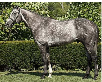
Flashy Bull

Scat Daddy won a couple of key races--the GI Champagne at two and the GI Florida Derby at three--but he never ran again after finishing third-last in the 2007 GI Kentucky Derby, and he never ran a Beyer number higher than his 99 in the Florida Derby. Tapit never ran better than a 98, though, and it hasn't stopped him from making a sire.