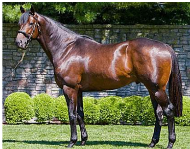
Scat Daddy

In contrast to Darley, their great rival Coolmore did not go on a spending spree in 2007. Their top 2006 two-year-old, Holy Roman Emperor (Danehill), had been pressed into stud service at three in 2007 when the star-crossed George Washington (Danehill) proved infertile, and is currently Leading Freshman Sire in Europe. Their principal 2008 retirements were Dylan Thomas (Danehill) and Excellent Art (Pivotal) in Ireland, and Scat Daddy, from Johannesburg's first crop, at Ashford in Kentucky.