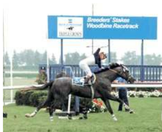
With Approval

The following year, With Approval won Belmont's 1 3/8-mile GII Bowling Green S. in a world-record 2:10 1/5 and, in his career finale, ran In the Wings (Ire) to a half-length in the GI Breeders' Cup Turf at Belmont ( video ). He concluded his career with 13 wins in 23