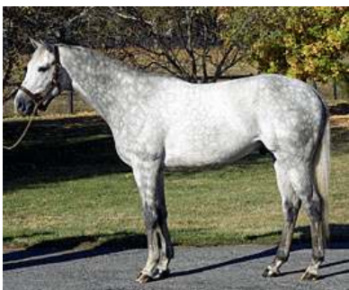
Political Force claibornefarm.com