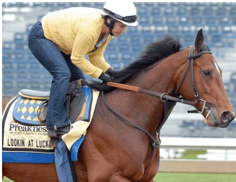
Lookin at Lucky

Reigning two-year-old champion and GI Preakness S. hero Lookin at Lucky (Smart Strike) returned to the track Tuesday after missing a week of training due to a fever. The $475,000 KEEAPR graduate was being pointed toward the GI Haskell Invitational at Monmouth Aug. 1 prior to the setback. He worked four furlongs in :47 2/5 at Santa Anita June 20. "He went back [Tuesday]; he looked good,"