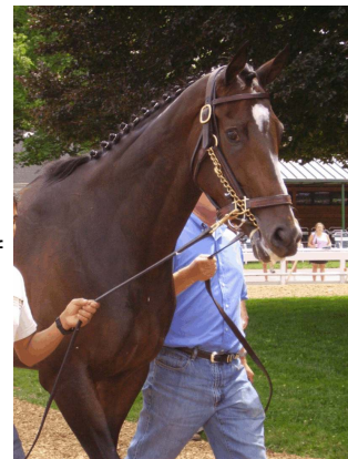
Rachel at Monmouth in '09