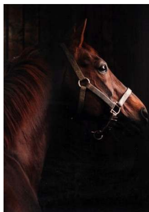
Thunder Puddles