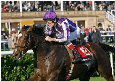
St Nicholas Abbey (Ire)

Tattersalls' summer highlight, the July Sale, gets underway in Newmarket this morning with the traditional mixed offering. There are 818 lots catalogued this year, compared to 732 in 2009, and the sale goes back to four days, after being held over three sessions 12 months ago. "It's a larger catalogue than last year, and the July Sale has always been a source of high-class horses-in-training and breeding stock, not least the dams of 2009 G1