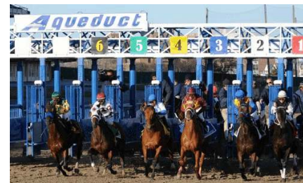
Action at the Big A

Penn National Gaming and the consortium of SL Green, Hard Rock International and Clairvest Group were both eliminated, leaving the Malaysian-based Genting New York as the only remaining bidder in the process that has dragged on for almost a decade. Genting's bid "appears to conform with all requirements of the bid submission process and will continue to be evaluated," according to the statement. Genting still requires the approval of the Division of Lottery and then unanimous approval from Governor David Paterson and leaders of the state legislature. If Genting is not approved, neither of the disqualified bidders will be eligible to be reconsidered. A decision from the Lottery is expected Aug. 3.