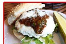
Arugula, Basil Ketchup, Parmesan Cheese, & Mozzarella Cheese