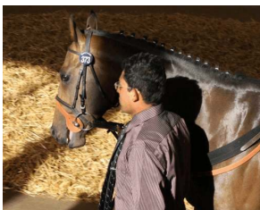
Drawing Board www.tattersalls.com

YOUTH OF TODAY The second day of the Tattersalls July Sale finished just before 10 p.m. in Newmarket last night with two more additions, both juveniles, to the week's list of six-figure lots. The dear-