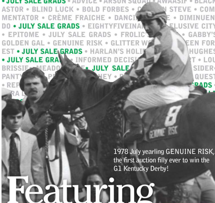
1978 July yearling GENUINE RISK, the first auction filly ever to win the G1 Kentucky Derby!