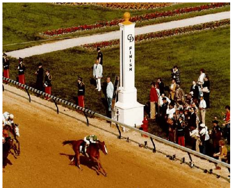
Genuine Risk takes the 1980 Kentucky Derby