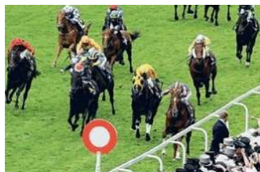
Starspangledbanner (rail)