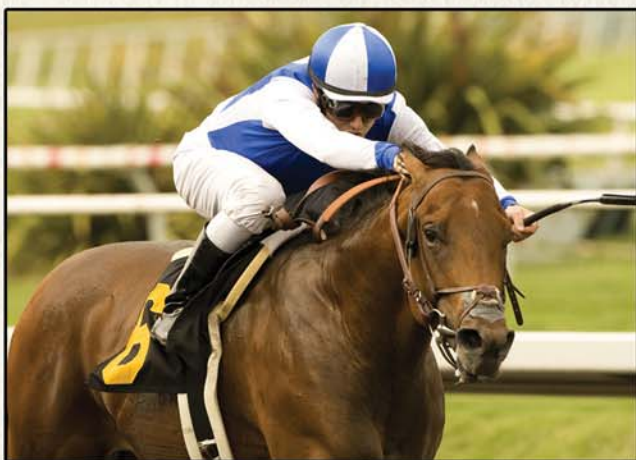
J P'S GUSTO won the Hollywood Juvenile Championship-G3 on July 5. The dual stakes winner is now pointing for the Best Pal S. at Del Mar on Aug. 8