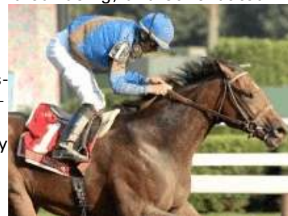
Majestic Warrior