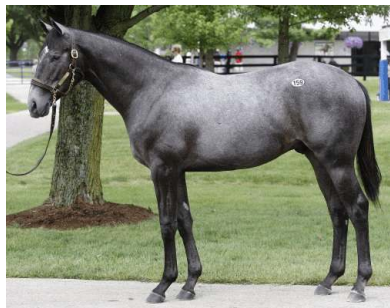
Hip 159 - Medaglia d'Oro colt