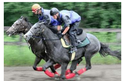
Deep Impact--Ski Paradise colt