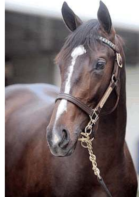
Position Limit at last year's F-T July Sale www.starlightracing.com

4th-BEL, $50,000, Msw, 2yo, f, 5 1/2f, 1:04 3/5, my. + POSITION LIMIT (f, 2, Bellamy Road--Payable On Demand, by Out of Place), a $55,000 FTKJUL yearling, was sent off at 4-1 in her unveiling. The dark bay filly was ridden out of the gate to take up a stalking position as Evangelical