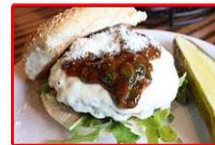
Arugula, Basil Ketchup, Parmesan Cheese, & Mozzarella Cheese