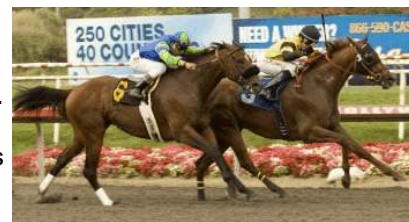
2010 GI Hollywood Gold Cup finish