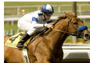
Sidney's Candy