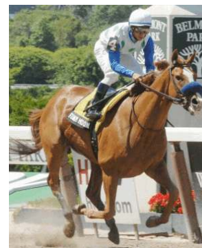
Funny Moon