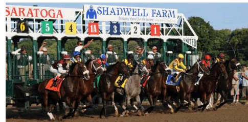
They're off at Saratoga...