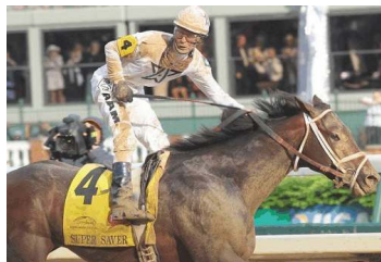
Super Saver

Super Saver (Maria's Mon), winner of the GI Kentucky Derby May 1, will continue to train in New York in preparation for the Aug. 1 GI IZOD Haskell Invitational at Monmouth. "He's at Belmont now," said conditioner Todd Pletcher, who trained 2006 Haskell winner Bluegrass Cat (Storm Cat) and 2007 hero Any Given Saturday (Distorted Humor). "We'll send him to Saratoga next week, and he'll train there up to the race. He'll van down early the morning of the race." The WinStar Farm colorbearer was last seen in the GI Preakness S. May 15, where he failed to keep hopes of a Triple Crown alive with an eighth place finish. Preakness winner and ☆ "TDN Rising Star" ☆ Lookin At Lucky (Smart Strike), Preakness runner-up and GI Belmont S. show horse First Dude (Stephen Got Even), and ☆ "TDN Rising Star" ☆ Trappe Shot (Tapit), victor of the Long Branch S. at Monmouth last weekend, join Super Saver at the top of the list of Haskell hopefuls.