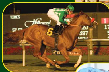
GRADE 3 WINNER Unzip Me