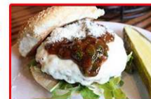
Arugula, Basil Ketchup, Parmesan Cheese, & Mozzarella Cheese

Try July's Burger of the Month Mulberry Street Burger