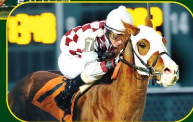
GRADE 3 WINNER Acting Zippy