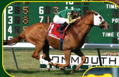
GRADE 3 WINNER Get Serious