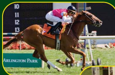
GRADE 2 WINNER Workin for Hops