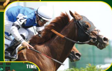
GRADE 3 WINNER Gleam of Hope