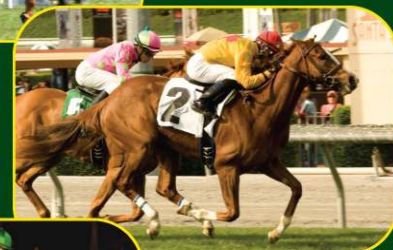
GRADE 2 WINNER City to City