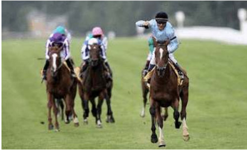
Harbinger leaves them in the dust at Ascot

Highclere Thoroughbred Racing's Harbinger (GB) (Dansili {GB}) dented some lofty reputations and lowered the track record--by 0.46 seconds--with a blistering display in Saturday's G1 King George VI & Queen Elizabeth S. at Ascot. Ridden with patience in fourth as Confront (GB) (Nayef) set testing fractions, the 4-1 chance swooped for control just inside the final quarter mile and surged ever clear