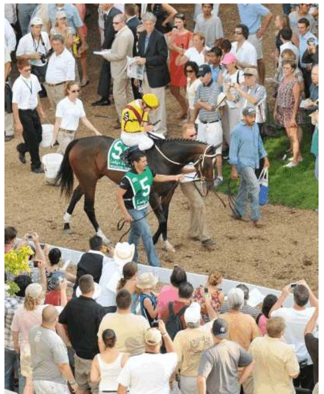
Rachel Alexandra ahead of the Lady's Secret

"SPECTACULAR!" -EVENING STANDARD "BEST MUSICAL REVIVAL" -2009 OLIVIER AWARD "ONE OF THE DECADES BEST!" -THE TIMES OF LONDON