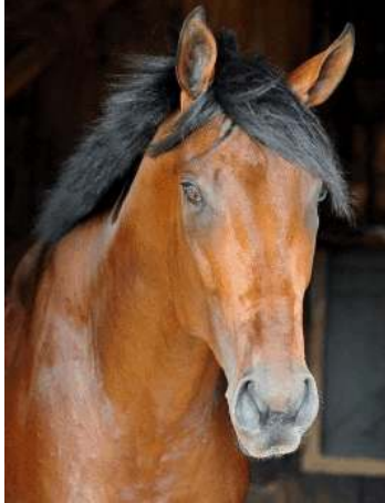
Quality Road