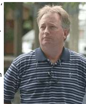
Boyd Browning Horsephotos

Browning thinks the overall sales market is on par with where the industry was last year. "I think if you look at it in a big-picture scenario, in a sense of the overall market, the reality is the market is pretty similar to last year," he explained. "I think there might be less activity or a little more constraint at the top of the market. Statistically, if you go from a sales top-per of $2.8 million [at Saratoga in 2009] to $1.2 million [this year] there is a $1.6-million swing in the gross over 117 horses sold--that's $15,000 in and of itself in the difference in the salestopper. But I think, horse for horse, walking through the sales ring in July and in Saratoga, and what we saw through most of the two-year-old season, is that the market is fairly similar in 2010 and 2009."