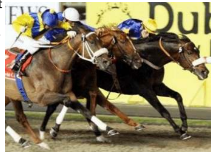
Gloria de Campeao (rail)