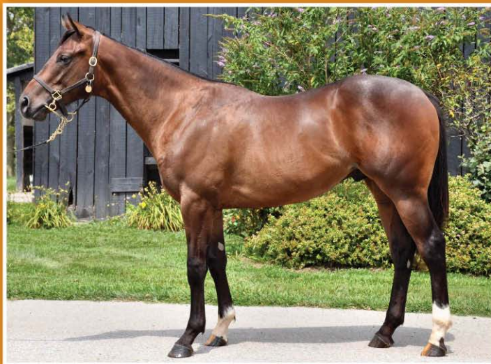
Hip 428 Tale of the Cat-Regard c.