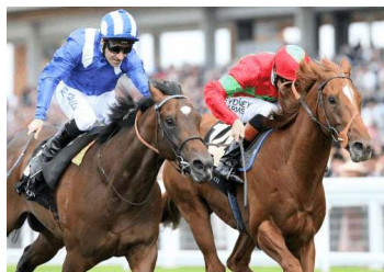
Strong Suit (right)

Aidan O'Brien boasts an outstanding record here, saddling 10 winners in the last 12 runnings, but this year's renewal is dominated by the G2 Coventry S.