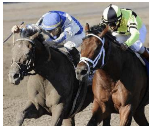
Blame (left)