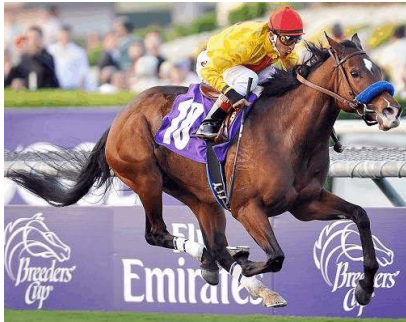
Tuscan Evening (2005-10)

GISW Tuscan Evening (Ire) (Oasis Dream {GB}--The Faraway Tree {GB}, by Suave Dancer) suffered an apparent heart attack after a six-furlong workout (1:15 2/5) on the turf at Del Mar Sunday morning and died. The five-year-old mare was perfect in six starts this year, most recently annexing the GIII Modesty H. at Arlington July 17. She was prepping for the Aug. 21