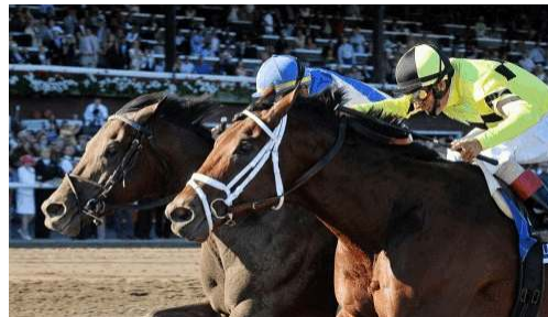
Blame (outside) overtakes Quality Road