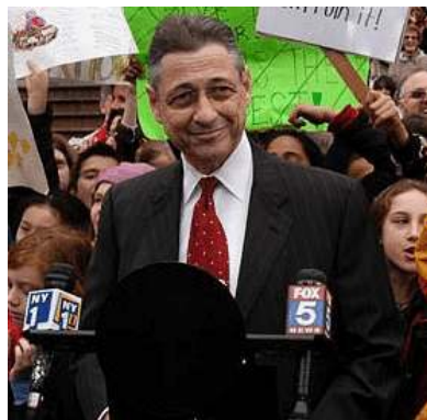
Speaker Sheldon Silver

"This has been a long time coming. I want to thank the leadership for their quick approval. Hopefully now we can move on full-speed ahead." Genting will pay the state an up-front fee of $380 million for the right to run the racino, and plans to have a 1,600-VLT facility up and running six months after the contract is signed. When it is completed, there will be 4,500 VLTs in operation at the track.