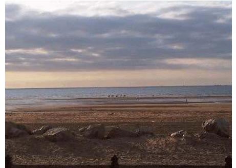
The View from Les 3 Mages