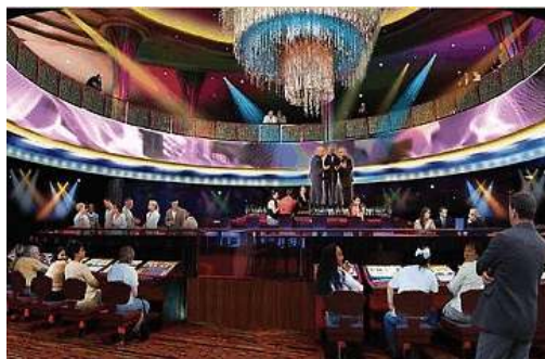
Genting's Mock-Up of the Aqueduct Casino