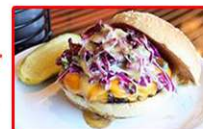
Smoked Cheddar, Red Cabbage Slaw, & Mustard BBQ Sauce

Try August's Burger of the Month Carolina Burger