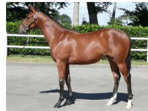
Hip 21