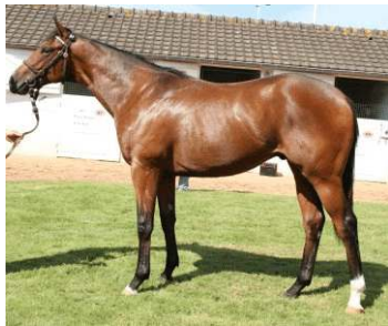
Oasis Dream colt hip 87