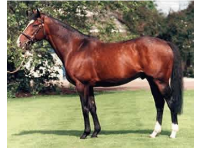
Sadler's Wells

Until now breeders have preferred to double up on the major elements in Sadler's Wells' pedigree by pairing his descendants with those of his close relative Nureyev. However, the 2008 German Derby fell to Khamsin, a colt inbred 4x4 to Sadler's Wells. If anything is going to act as a deterrent to inbreeding to Sadler's Wells, it will be the fear that it will produce horses with too much stamina for today's commercial market. Remember, though, that Sadler's Wells sired three winners of the 2,000 Guineas, three of the Irish 1,000 Guineas and two of the Irish 2,000 Guineas.