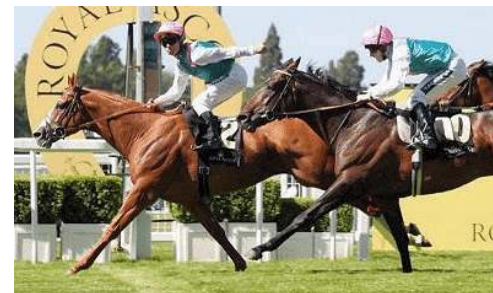
Byword (GB) leads home Twice Over (GB) in G1 Prince of Wales's