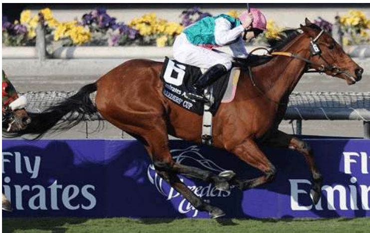
Midday wins last year's GI Breeders' Cup F/M Turf