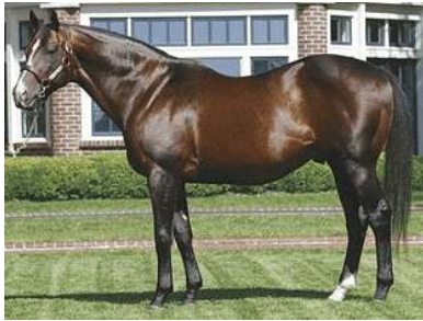
A.P. Indy www.lanesend.com

Since 2004, only seven percent of A.P. Indy's year-starters have been in Europe or Japan. He's an all-American sire, that's for sure, but to lead all four of these categories--2.92 ABC Runner Index (over 23 percent of his year-starters); 111 A Runners since 2004 (Sadler's Wells second, with 109, then a gap back to Giant's Causeway, in third, with 94); and 266 ABC Runners--well, I'd call it a truly mighty performance. He's maybe as good a sire