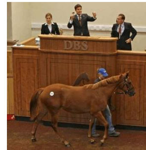
Lot 182 - Kyllachy filly