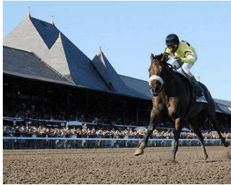
A Little Warm

Lack of graded earnings kept A Little Warm from a shot at the GI Kentucky Derby, and a fever derailed him from the GI Preakness S. When he finally made it back to the track, he was again sent around two turns, this