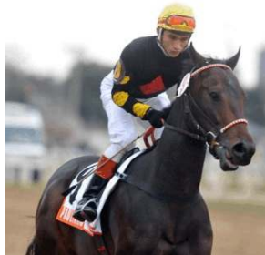
Diario La Hipica