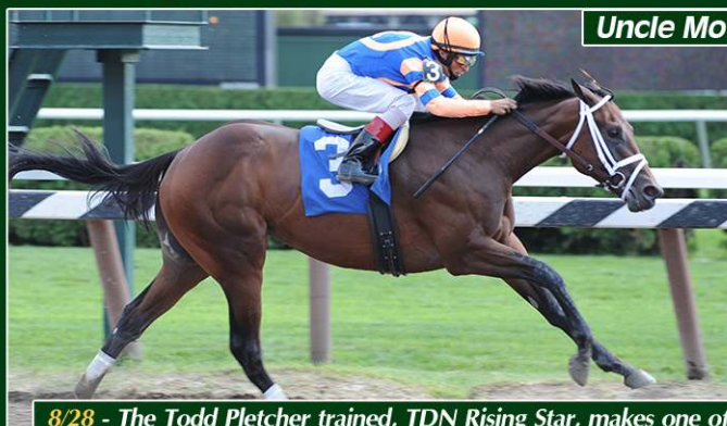
8/28 - The Todd Pletcher trained, TDN Rising Star, makes one of the most impressive debuts in recent memory - A 14 length Saratoga win with a 102 Beyer Speed Figure and a 2 1/2 Ragozin Number