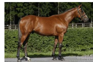
Lot 40 bbag-sales.de