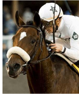
American Lion