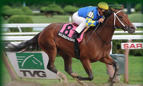
Hilda's Passion dominates the Bennington S. at Saratoga by 8 3/4 lengths.

Gone West – MGSW Borodislew, by Seattle Slew