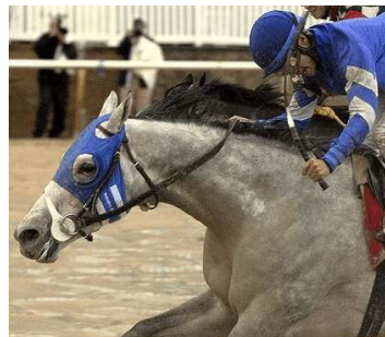
Vineyard Haven