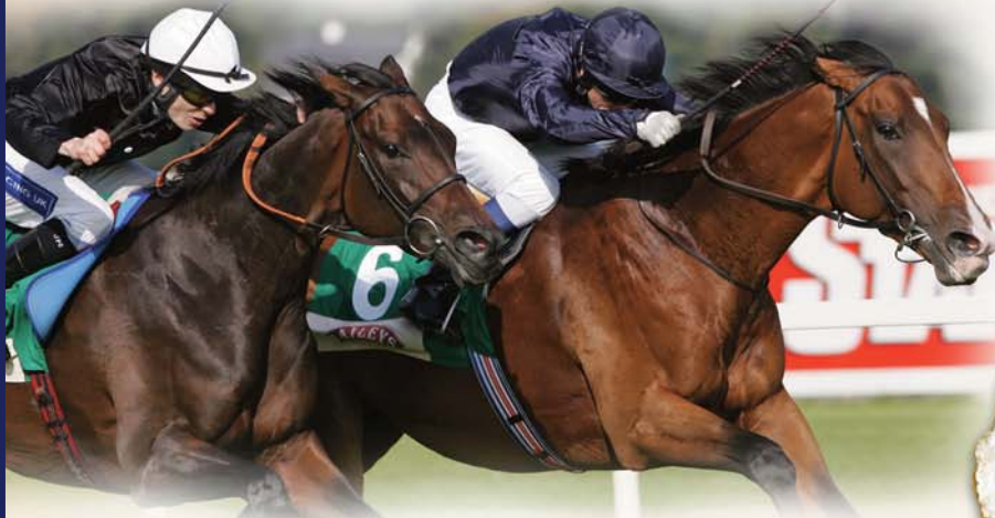
Dylan Thomas defeats Ouija Board in the 2006 Irish Champion Stakes-Gr.1

“He was bred to be a good horse - by a champion stallion out of a mare who has already thrown a top performer in Queen's Logic - and DYLAN THOMAS fully lived up to expectations.... Add to that fine looks and Danehill's record as a sire of sires, and you have the perfect credentials for a stallion”