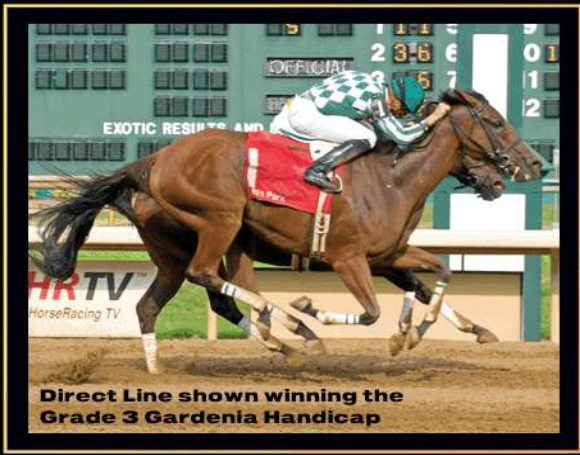
Direct Line shown winning the Grade 3 Gardenia Handicap

CANADIAN-BRED YEARLING FILLY FROM THE LAST CROP OF DIXIELAND BAND OUT OF STAKES PRODUCER STEPH'S TEE