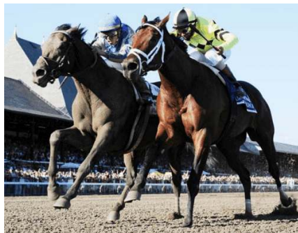
Blame (left) outdueling Quality Road in the Whitney