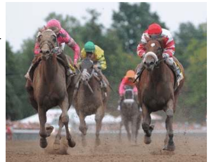
Blind Luck (left) gets the better of Havre de Grace in the Alabama

The chestnut filly, who thrives on her training and her racetrack appearances, has traveled from her California base on four occasions this season, and each has resulted in success. Victorious in the GII Fantasy S. at Oaklawn in April, she shipped back home and then to Kentucky for a sensational last-to-first score in the GI Kentucky Oaks. Runner-up to Switch (Quiet American) when at the mercy of a dawdling pace in the GII Hollywood Oaks June 6, she gave Havre de Grace six pounds and a nose defeat in the GII Delaware Oaks July 10. With divisional supremacy on the line in the GI Alabama S. Aug. 21, Blind Luck was handier to another sluggish pace, flew past Devil May Care (Malibu Moon) at the eighth pole and tagged Havre de Grace for a half-length tally. That went a long way towards clinching a championship, and the absence of Devil May Care this weekend arguably presents Blind Luck with a free square. Not only will the slightly built filly have to tote highweight, she gets an additional two pounds for being a Grade I winner in 2010, and therefore will carry 10 pounds more than her rivals. That could level the playing field for Havre de Grace, given the narrow margins of victory in their last two meetings.