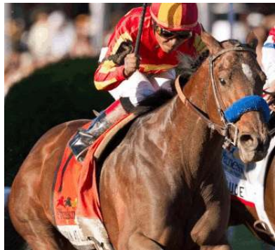
Lookin At Lucky

GI Breeders' Cup Classic hopeful Lookin At Lucky makes it back to the races after missing some training time with illness. The pro-tem divisional leader and GI Preakness S. hero emerged from his dazzling victory