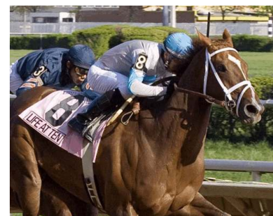
Life At Ten Four Footed Fotos

snapped in the GI Personal Ensign S. at Saratoga Aug. 29. The five-year-old went on a tear dating back to last November and culminating with powerful wins in the GI Ogden Phipps H. at Belmont June 12 and the GII Delaware H.