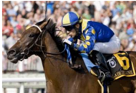
'09 Arc Sale graduate Eclair de Lune at Arlington

Arqana hosts its Arc sale at Saint-Cloud today following racing across Paris at Longchamp. The sale's reputation as a source of top-class racehorses is firmly established, with an honor roll that includes graduates such as Urban Sea (Miswaki), Megahertz (GB) (Pivotal {GB}), Elmhurst (Wild Again), Aube Indienne (Fr) (Bluebird) and