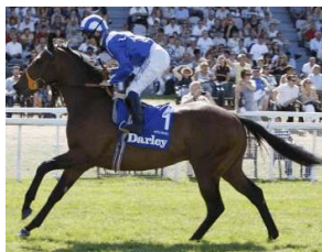
Arcano

ARCANO TO DERRINSTOWN Sheikh Hamdan Al Maktoum's Group 1 winner Arcano (Ire) (Oasis Dream {GB}--Tariysha {Ire}, by Daylami {Ire}) has been retired from racing and will stand in 2011 at his owner's