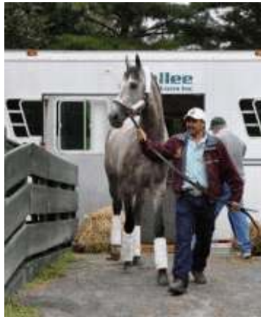
Paddy O'Prado arriving Friday at Belmont