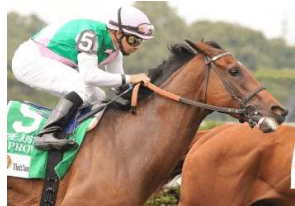
Proviso

Proviso goes for a fourth consecutive Grade I score this afternoon. Disqualified to second after crossing the line best in the GI Juddmonte Spinster S. over the Keeneland Poly last fall, the bay weakened to be fourth in the GI Breeders' Cup Ladies Classic in her 2009 finale. The Juddmonte homebred ran second in the