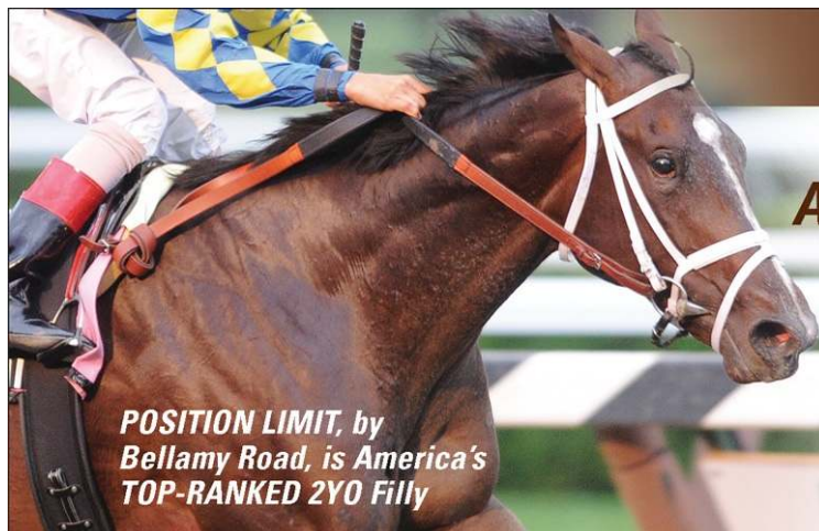
POSITION LIMIT , by Bellamy Road, is America's TOP-RANKED 2YO Filly

Twice a Group 3 winner in France and runner-up in the 2007 G1 Fillies' Mile, Proviso was fourth to Life Is Sweet (Storm Cat) in the GI Breeders' Cup Ladies' Classic following her Spinster disappointment. Runner-up in the GI Santa Monica H. on the Pro-Ride Jan. 31, she bounced back to best males in the GI F. E. Kilroe Mile H. Mar. 6. The homebred made the most of a pair of starts in New York over the summer, adding the GI Just A Game S. at Belmont June 5 and the GI Diana S. up at Saratoga July 31. Last but one beneath Mike Smith to the stretch yesterday, Proviso still had just Gotta Have Her (Royal Academy) behind her as they cornered, but rallied under a full head of steam to score, covering her final quarter mile in an unconscious :21 4/5. Click for the brisnet.com chart , the brisnet.com PPs or the free brisnet.com catalogue-style pedigree . Video, sponsored by Taylor Made.