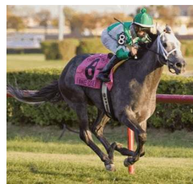
Four Footed Foto

Yankee Fourtune made one appearance as a juvenile, fading to seventh in a main-track sprint at Monmouth last September, and went to the sidelines. He led every