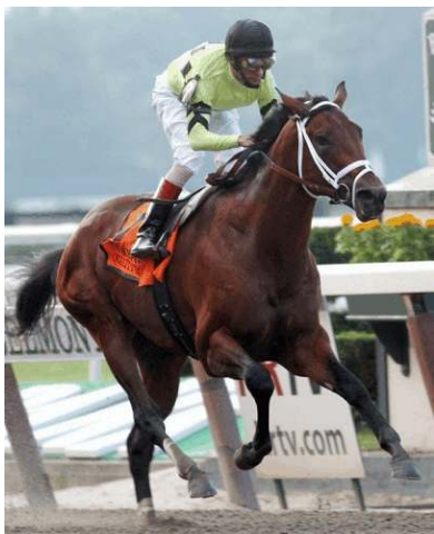
Quality Road