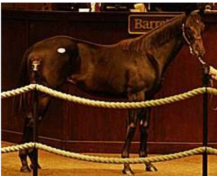
Hip 125, $105,000 Bertrando topper