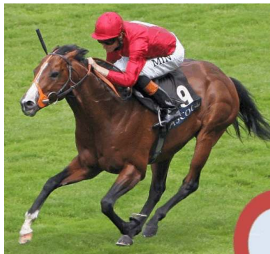
Paco Boy

Richard Hannon yesterday gave the go-ahead for Paco Boy (Ire) (Desert Style {Ire}) to contest the Nov. 7 GI Breeders' Cup Mile. Last seen finishing runner-up to Goldikova (Ire) (Anabaa) in Longchamp's G1 Prix de la Foret on Arc day, the five-year-old who is set to stand at Highclere Stud at the end of the term has given all the right signals for a rematch. "Paco Boy has a terrific turn of foot and the style of American racing should suit him, but there is a certain Goldikova standing in our way again," Hannon commented. "She is the dual world champion and we have yet to beat her in four attempts, but we got to within half a length of her at Longchamp last week and, with this being Paco Boy's final race before he starts his stallion career at Highclere Stud, I don't blame the owners for wanting to have a go at the big bucks."