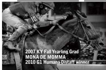
2007 KY Fall Yearling Grad MONA DE MOMMA 2010 G1 Humana Distaff winner