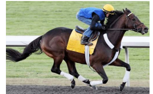
Blame

Blame (Arch) , who suffered his first loss of the year when second in the GI Jockey Club Gold Cup, and Gold Cup winner Haynesfield (Speightstown) both worked yesterday in Kentucky in preparation for the Nov. 6 GI Breeders' Cup Classic, while Quality Road (Elusive Quality) tuned up in New York. Cont. p7