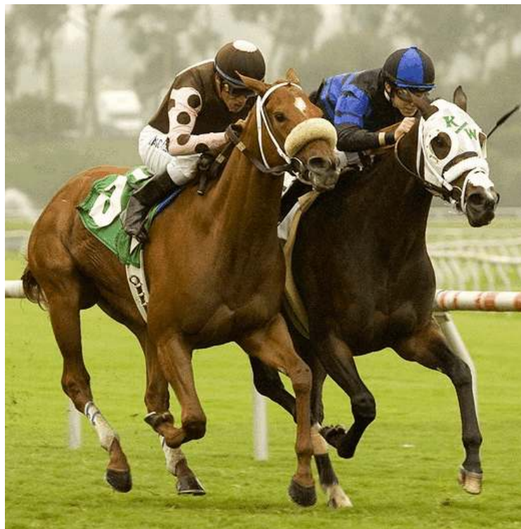
Go Forth North (North Light {Ire}) (outside) overtakes All Due Respect (Value Plus) to win yesterday's GIII Harold C. Ramser Sr. H. at Oak Tree at Hollywood. Benoit