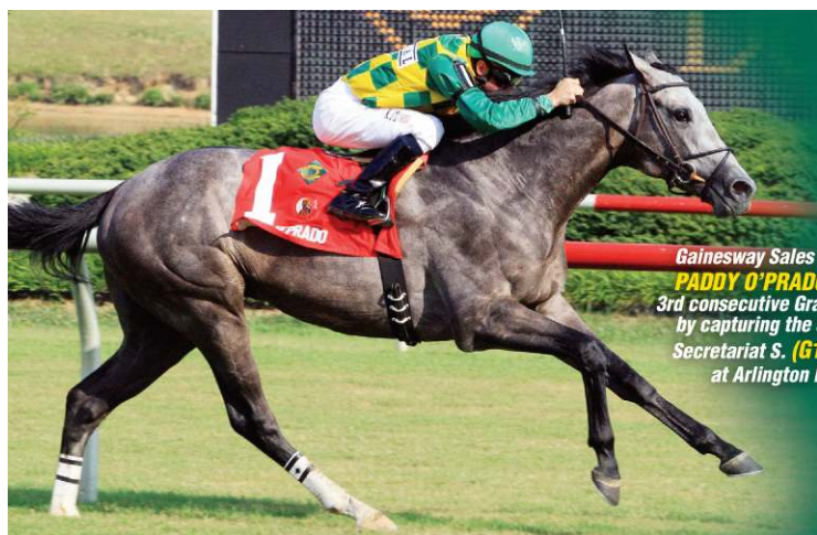
Gainesway Sales Graduate PADDY O'PRADO won his 3rd consecutive Graded Stakes by capturing the $400,000 Secretariat S. (G1) Aug. 21 at Arlington Park.