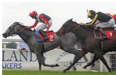
Native Khan