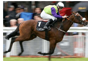
Dunboyne Express