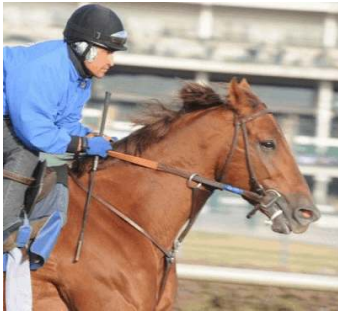
Sidney's Candy