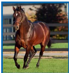
NEW DESERT PARTY Street Cry - Sage Cat, by Tabasco Cat