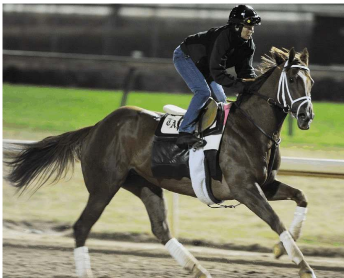
Life At Ten