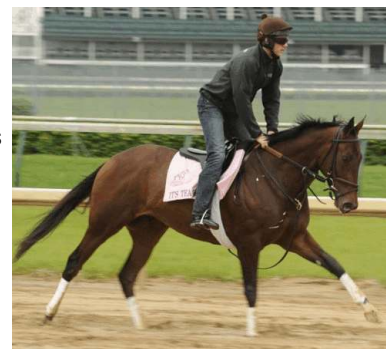
It's Tea Time