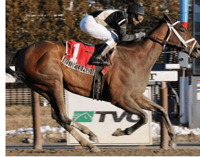
Distorted Passion A Coglianese

"It's kind of like the post position draw, you can't help the way it turned out," he commented. "The decision to enter all the horses was made past the deadline for Keeneland, so we had to think outside the box. I think it will be fine. I think it will add some buzz to the end of the sale. Normally you don't like being the last hip number in, but I don't think anyone is going to leave knowing that these kind of horses are coming through at the end of the session."