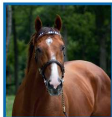
NEW MIDSHIPMAN Unbridled's Song - Fleet Lady, by Avenue Of Flags

It is Open House at Darley from Monday (Nov 8) to Saturday (Nov 20), 12 noon-3:30pm. Be sure to stop by and see the stallions, including new boys Midshipman , Eclipse Champion and the fastest ever Breeders' Cup Juvenile winner, and Desert Party , Street Cry's $2.1 million G2 Sanford winner.