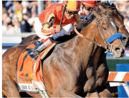
Lookin At Lucky