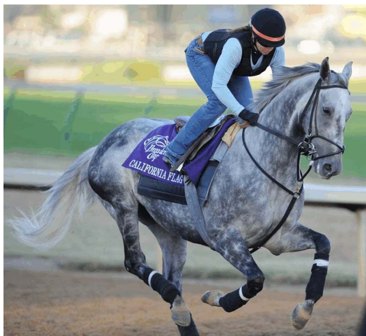
GI BC Sprint hopeful California Flag