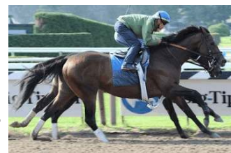
Blame