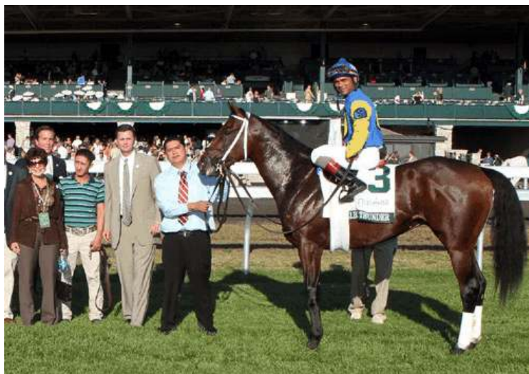
GI Dixiana Breeders' Futurity Winner's Circle