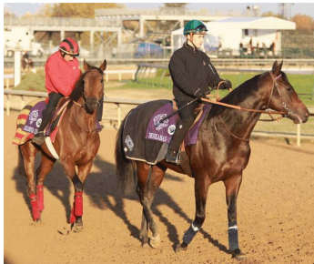
Behkabad (Fr) (right) & Goldikova (Fr)

Behkabad (Fr) (Cape Cross {Ire}), who boasts six wins from nine career starts, suffered the worst finish of his career when he was fourth in the Oct. 3 G1 prix de l'Arc de Triomphe. The three-year-old was four lengths behind winner Workforce (GB) (King's Best) that afternoon, but jockey Christophe Lemaire thinks his mount can get the better of the Arc winner in the GI BC Turf.