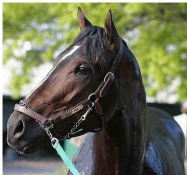
Musket Man