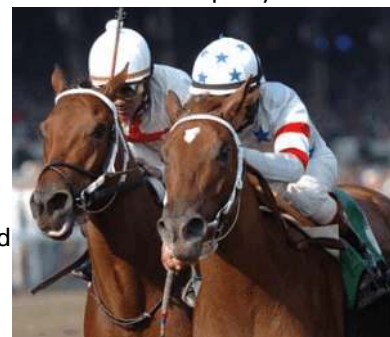
Subtle Aly