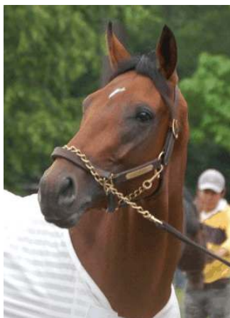
Big Brown Sherackatthetrack

IEAH Stables, fresh off its victory with Eldaafer (A.P. Indy) in the Gill Breeders' Cup Marathon last weekend, played the role of seller at Keeneland Tuesday. The