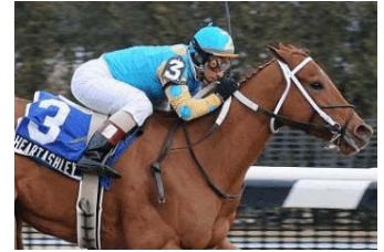
Heart Ashley