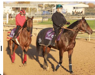
Behkabad leads Goldikova at Churchill last week