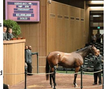
Dreamtheimpossible sells for $2.55 million