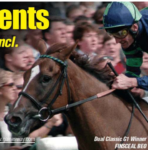
Dual Classic G1 Winner FINSCEAL BEO