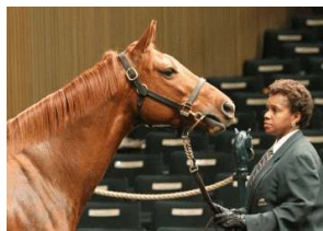
Baroness Thatcher