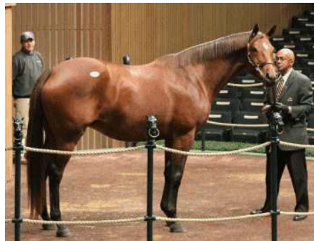
Lucky One

Fairlawn Farm's Lucky One (Best of Luck--Twilight Spectre, by Imp Society) ( hip 429 ), the dam of pro-tem champion three-year-old filly Blind Luck (Pollard's Vision), was yesterday hammered down to Shadai Farm