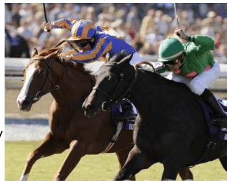
Heart Shaped (outside) at Santa Anita in 2008